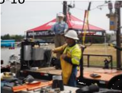
Attendees enjoyed a live demo by United Power on electrical hazards