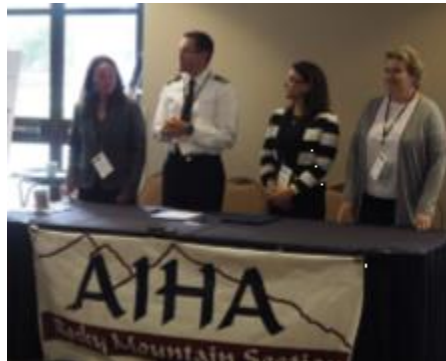
Memorandum of Understanding signed between the University of Romania and the AIHA- RMS chapter