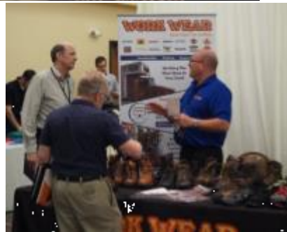
Attendees stop by the Exhibitor Hall