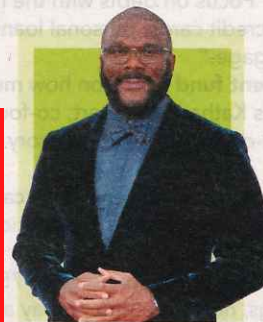
TYLER PERRY, 51 $97 million (est.) The director, producer and famously charitable entertainment mogul, known for the Madea film franchise, worked to mobilize voters throughout the election year.